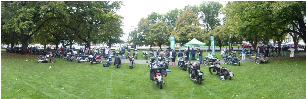
Part of the Rally display on the lawns of Parliament House, Hobart.

A huge success with about 120 pre-1970's bikes and 150 enthusiasts and importantly, some 16 members of the Coffs Club! Ask any of them how good it was? Dare you, you won't get away for ages!